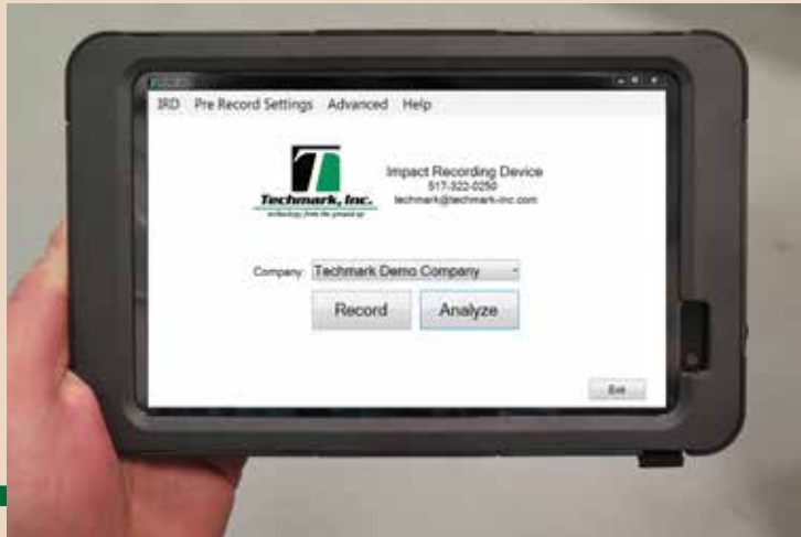
Tablet with PCIRD 4.5 pre-installed.